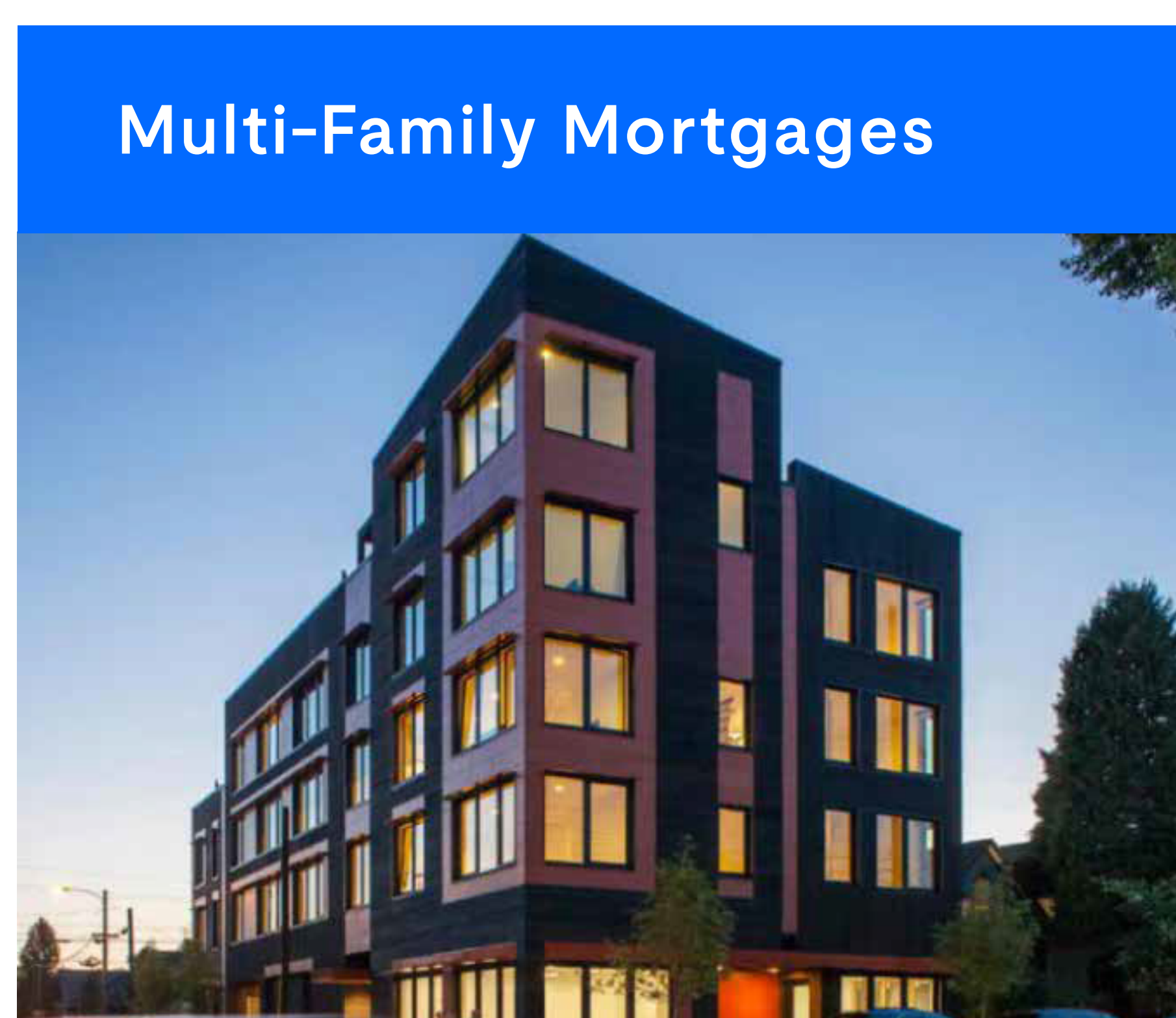
Quebec City, QC