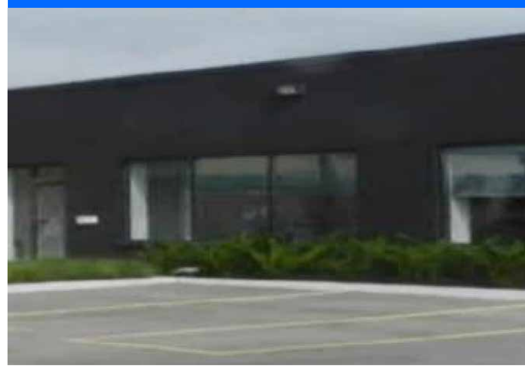
Quebec City, QC